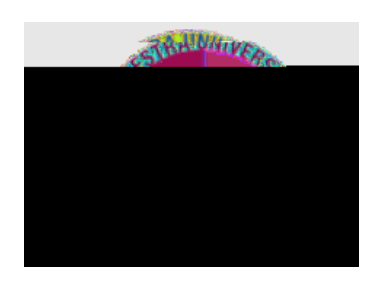
Cabinet Agenda PPAW Conference Room April 26, 2023